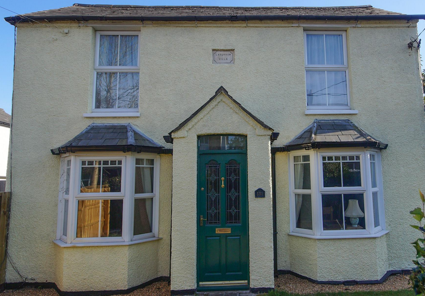
Laburnum Villa 131 High Street Prestwood Buckinghamshire HP16 9EX